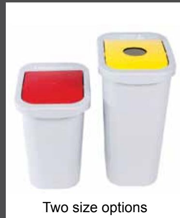
Two size options