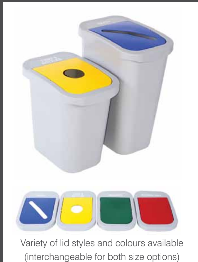
Variety of lid styles and colours available (interchangeable for both size options)

SULO MGB Australia 123 Wisemans Ferry Road Somersby NSW 2250 Australia T: (02) 4348 8188 F: (02) 4348 8128