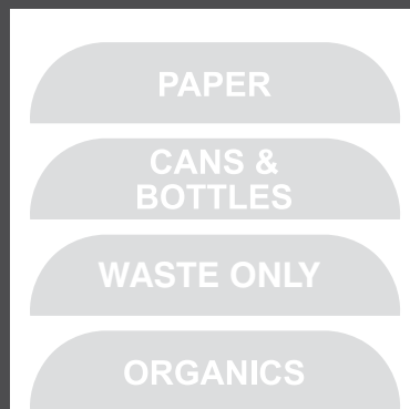
Standard clear and white decals