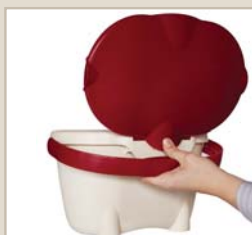
Ergonomic design for effortless emptying