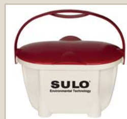
Elegant design is easily customised