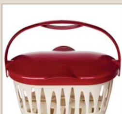
Sturdy carry handle with comfort grip