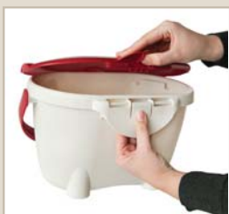
Removable lid for easy cleaning