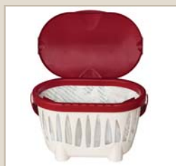
Retainer neatly secures a compostable bag