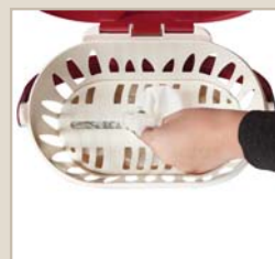
Optional aerated grill doubles as a bag dispenser