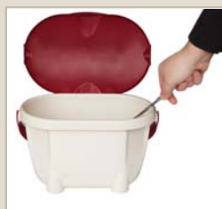
Wide opening with unique knife scraper for easy use