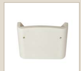
Optional bracket for discrete cupboard storage