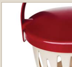
Handle lock secures lid during transport