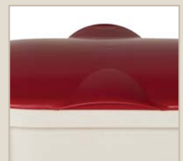
Odour lip provides a neat seal all round