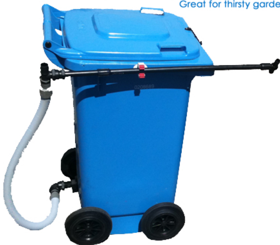
140 Litre "Plant-Direct" Model

Great for thirsty garden beds and Fruit Trees!