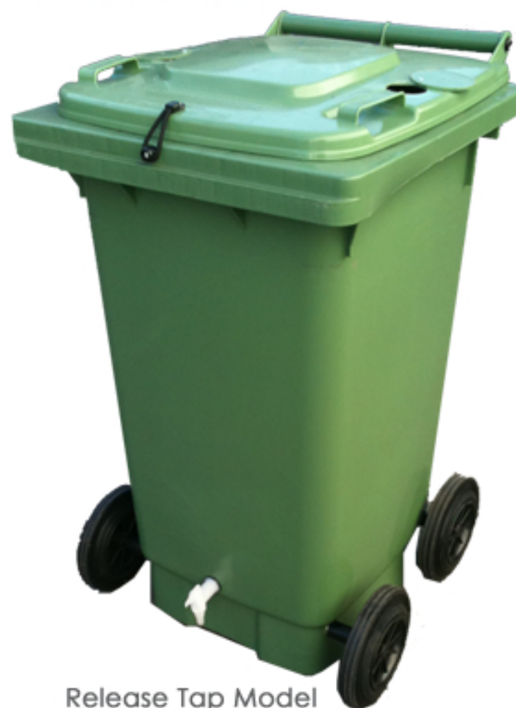
Release Tap Model

The Watering Wand Model is designed to provide the operator with Plant-Direct watering capabilities.